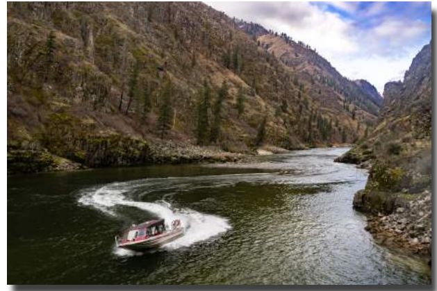
"Growler" Headed to the Lodge!

With the miles and miles of river and peace and serenity that the Salmon River has to offer, you won't find yourself picking up the phone for anything but to take a photo. Join us and our staff for a truly unforgettable Wilderness getaway.