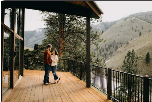
A Perfect Couples Getaway