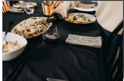
5 Star Meals deep in the Wilderness

You will arrive at a beach just below our lodge, here our staff will unload your gear as you either ride up or take a short hike up to the lodge! You will be able to settle in, unpack, and explore beautiful Mackay Bar. Once evening hits you will enjoy a full course supper and appetizers prepared by staff!