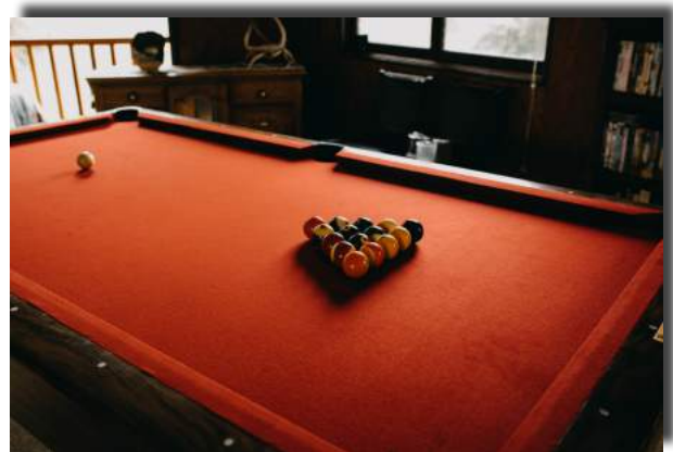
Enjoy a game of pool upstairs!

*This itinerary is just intended to be a sample, we can cater the trip to the needs and wants of any of our guests! Feel free to ask us